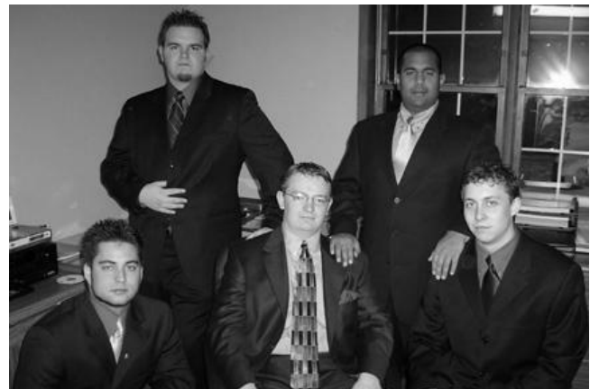
2005 Active E-board