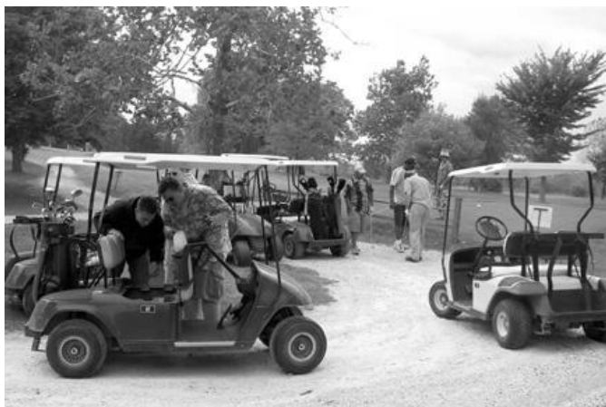
Where is the Flux Capacitor on this thing????