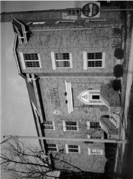
Marquette Triangle Fraternity Chapter House 806 North 15th Street, Milwaukee, WI 53233

Non-Profit Organization U.S. Postage PAID Milwaukee, WI Permit No. 5099